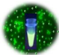
Fig.1 BcMag™ Terbium Fluorescence Magnetic Beads

BcMag™ Hydrazide-activated Terbium Fluorescence Magnetic Beads (Fig.1) are Time-Resolved Fluorescence (TRF) magnetic microspheres grafted with a high density of hydrazide functional groups on the surface. Hydrazide chemistry is effective for labeling, immobilizing, or conjugating glycoproteins via glycosylation sites, which are frequently (as with most polyclonal antibodies) positioned in domains distant from the critical binding sites whose function needs to be preserved. Coupling antibodies in this manner selectively targets heavy chains in the Fc portion of the molecule, assisting in the best possible preservation of antigen binding activity by the ends of the Fv regions. At pH 5 to 7, hydrazide-activated supports and compounds will conjugate with carbonyls of oxidized carbohydrates (sugars), resulting in the production of hydrazone linkages.